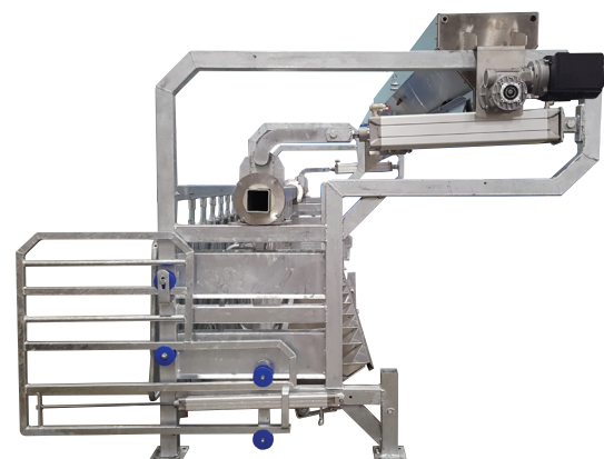
Side view of 4211116-SS Sheep / Goat Deluxe Stall w / Feeding 1x16.

*Animals per hour is based on sheep in Greece, not high genetic production animals; for goats you should calculate at least 10% more.