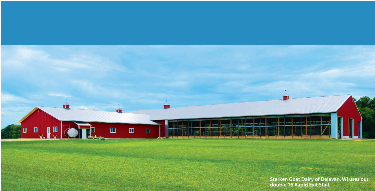
Sterken Goat Dairy of Delavan, WI uses our double 16 Rapid Exit Stall.

We carry a wide variety of equipment and supplies for goats and sheep.