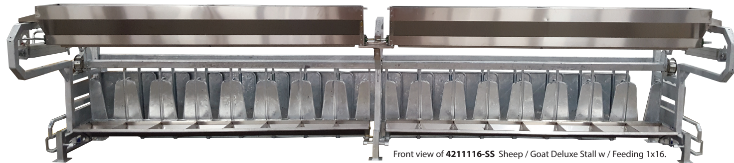
Front view of 4211116-SS Sheep / Goat Deluxe Stall w / Feeding 1x16.