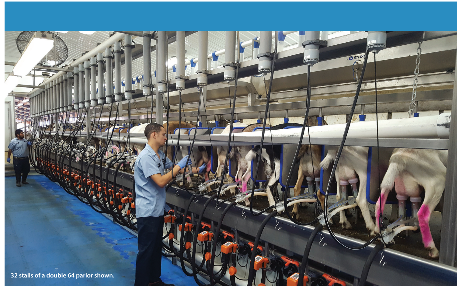
32 stalls of a double 64 parlor shown.